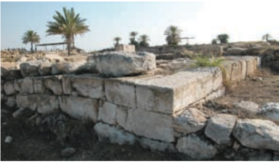
The northern palace

6. The northern stables – Two stable complexes were found at Megiddo – one on the northeastern part of the mound and one in the southwest. They reveal Megiddo's importance as a cavalry base or a center for commerce in horses. The construction of the stable-city is attributed to one of the Israelite kings, perhaps Jeroboam II, in the eighth century BCE or to King Ahab, in the ninth century BCE. Some scholars believe that the stables were used for other purposes – as storehouses, markets, or army barracks. On the left, part of a stable can be seen, including pillars and mangers. This northern part of the complex included 12 stables; the southern part was removed by the Chicago expedition to reach the level of the Early Canaanite period (the Early Bronze Age). The Tel Aviv University expedition completed the excavation of the stables and uncovered an impressive portion of the southern facade of the northernmost stables, which is slated for conservation and reconstruction. Additional stables were discovered on the southern part of the mound (16). The stable walls were built of mudbrick on a foundation of ashlar, some of which were probably robbed from the ruined northern palace (7). The large number of stables attests to a strong city government at the time they were built and to Megiddo's status as a major chariot city.