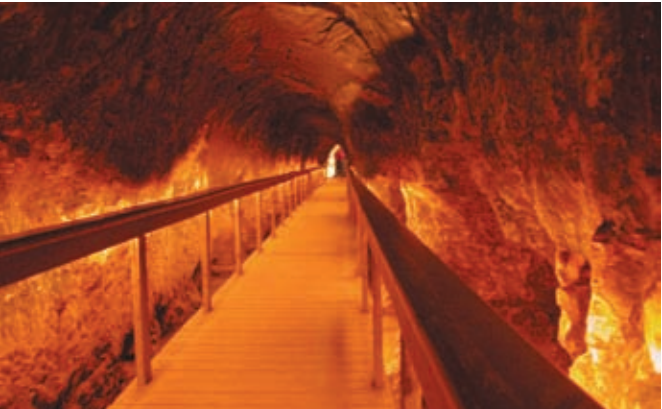
The horizontal tunnel of the water system