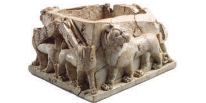
An ivory box carved with sphinxes

3. The Canaanite palace – On the other side of the Canaanite gate, on the right, is a massive stone wall, two meters thick, the sole remnant on the site of the palace of Megiddo's Canaanite ruler. The palace was built during the Middle Canaanite period, reaching its greatest size and opulence in the Late Canaanite period. It was a huge structure in local terms – the portion unearthed in the excavations measured 50 x 30 meters. Its plan, with a central, open courtyard surrounded by rooms and smaller courtyards, was influenced by contemporaneous Syrian architecture. Basalt steps alongside the stone wall were part of a street that ascended from the city gate to a plaza in front of the palace. The palace was destroyed in a conflagration in the mid-twelfth century BCE. An assemblage of hundreds of carved ivory artifacts was discovered in one of its rooms, dubbed the 'treasure room' by