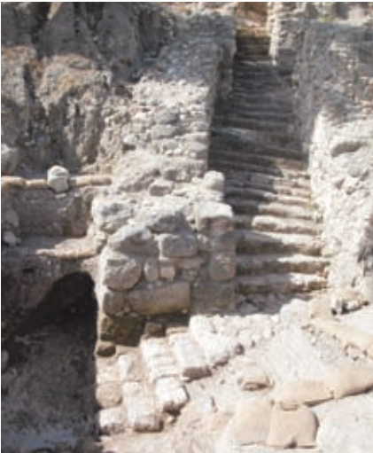
The reservoir at the entrance to Tel Megiddo, from the Israelite period II

2. The Canaanite city gate – Flanked by four chambers, the gate was built during the Late Canaanite period (the Late Bronze Age). At that time, the city was not fortified, which meant that the