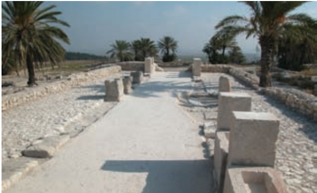
The reconstructed stable

From here, pass the water system, to which you will return later, and head to the Assyrian quarter and the Assyrian palaces.