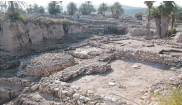
The temple area and the High Place from the Early Bronze Age

Tel Megiddo National Park was officially declared a national park in 1966. In 2005, the United Nations Educational, Scientific and Cultural Organization (UNESCO) inscribed Tel Megiddo as a World Heritage Site, together with the biblical tells of Hazor and Beer Sheva.