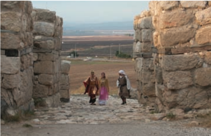
City gate at Megiddo from the Late Canaanite period

gate was ceremonial rather than defensive – it served as the entrance to the palace complex of that period. During its last phase, when ovens were built in its chambers, the gate probably served as a kind of service wing of the palace. The gate went out of use after the palace was burned at the end of the Late Canaanite period.