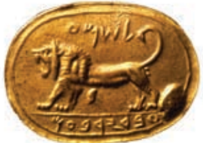
Seal with the inscription 'to Shem'a, servant of Jeroboam'

14. The southern palace – Nothing is left of the southern palace now except the courtyard and the gate you see here, the remains having been dismantled by the Chicago expedition to reach earlier strata. The plan of the southern palace resembles that of the northern palace (7). Near its outer gate, Schumacher discovered the seal with the inscription 'to Shem'a, servant of Jeroboam.' Apparently referring to Jeroboam II, this is the earliest seal of an Israelite king discovered to date. Unfortunately, the original seal was lost, leaving only a drawing. The palace has been dated to the tenth century BCE, with some scholars dating it later, to the ninth century BCE and the reign of Ahab.