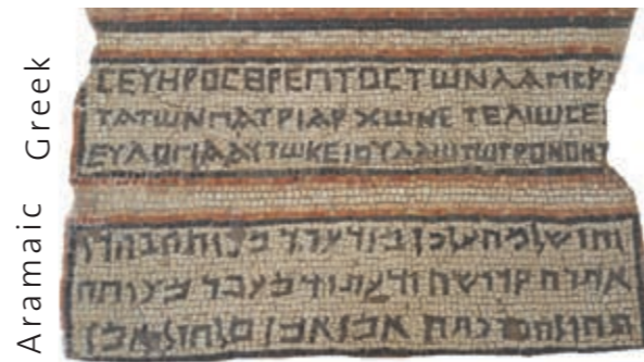
Translation from Aramaic: "May peace be upon anyone who has offered charity in this holy place and anyone who will offer charity may he be blessed. Amen Amen Sela and for myself Amen."